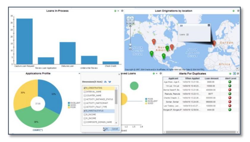
Figure 3. Oracle Business Activity Monitoring (BAM) is used to assemble interactive, bidirectional web-based dashboards

Oracle Business Activity Monitoring (BAM) enables the rapid composition of bidirectional graphical dashboard to not only gain real-time visibility into the performance of business processes but also the ability to respond to specific situations.